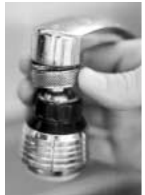
Figure 9 Removing aeration nozzle and gasket